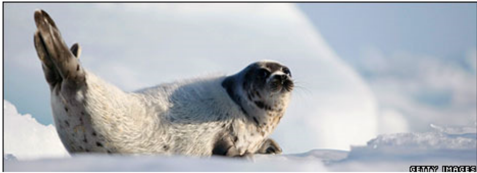
A widespread Arctic melt would have major impacts on wildlife

Data from the US National Snow and Ice Data Center (NSIDC) shows that the year began with ice covering a larger area than at the beginning of 2007.