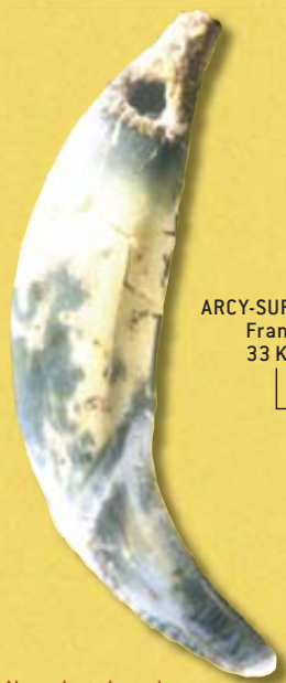
Neandertal-made pierced tooth from Arcy-sur-Cure, France: 33,000 years old

Recent finds, including those from Blombos Cave in South Africa, are revealing that many sophisticated practices emerged long before 40,000 years ago at sites outside of Europe, suggesting that humans were our cognitive equals by the time they attained anatomical modernity, if not earlier. Indeed, the fact that at least some Neandertals appear to have thought symbolically raises the possibility that such capacities were present in the last common ancestor of Neandertals and H. sapiens . The map below shows the locations of the sites mentioned in the article.