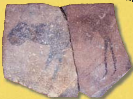
Oldest evidence of painting in Africa from Apollo 11 Rock Shelter in Namibia: 28,000 years old