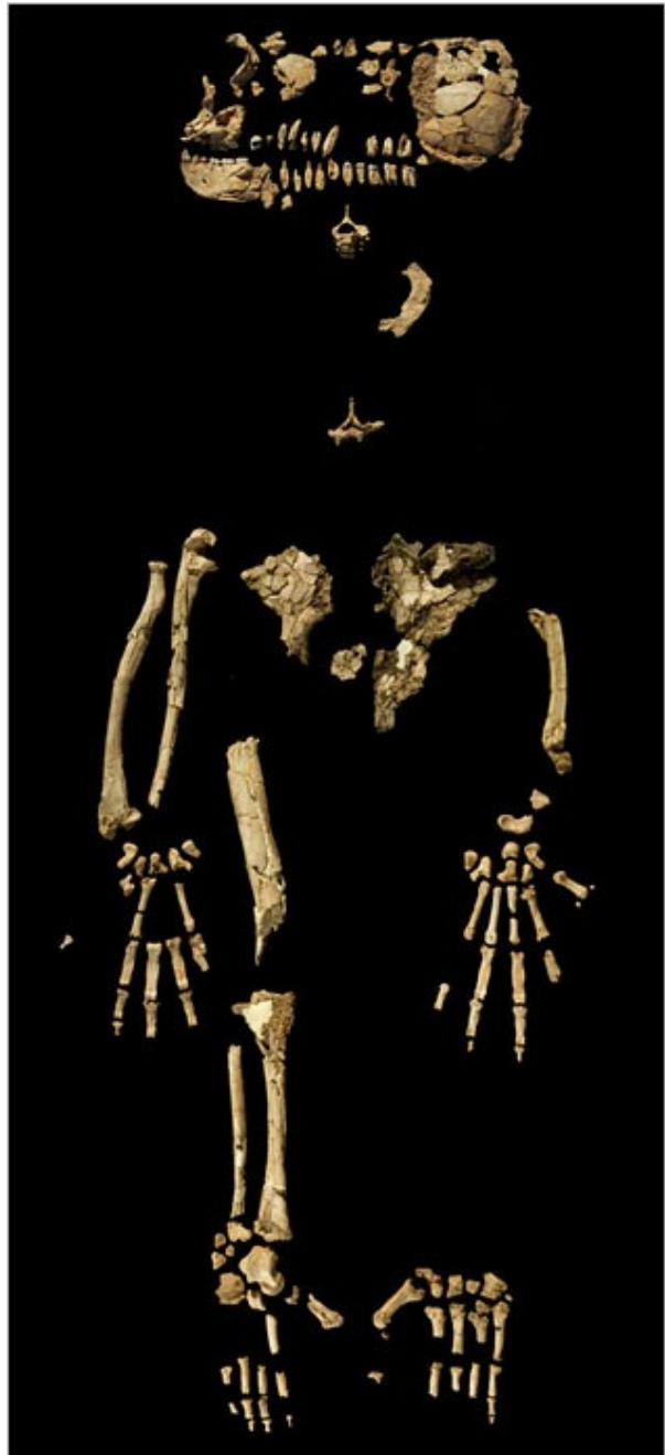
A fairly complete skeleton of Ardipithecus ramidus , which replaced Lucy as the earliest known skeleton from the human branch of the primate family tree.

The other two significant stages occurred with the rise of Australopithecus , which lived from about four million to