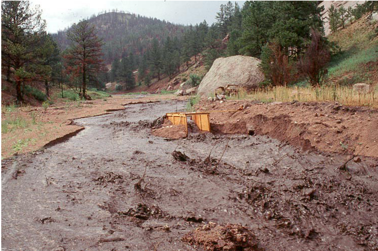
Communities may soon have advance warning of flash floods.

People living near vulnerable creeks and rivers along Colorado's Front Range may soon get advance notice of potentially deadly floods, thanks to a new forecasting system being tested this summer by the National Center for Atmospheric Research (NCAR) in Boulder, Colo.